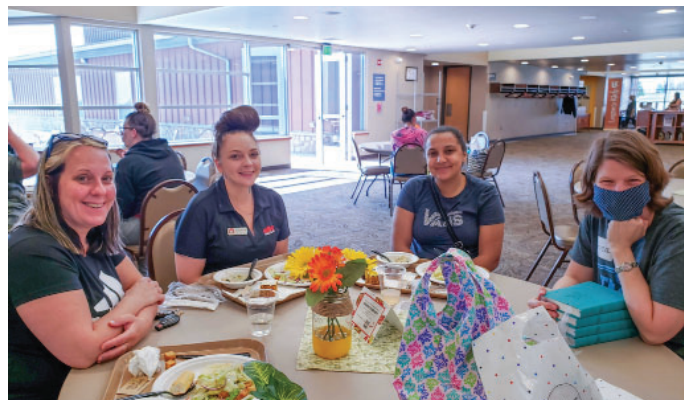
Single Mom's Blessing Day at Legacy UMC in Bismarck, ND