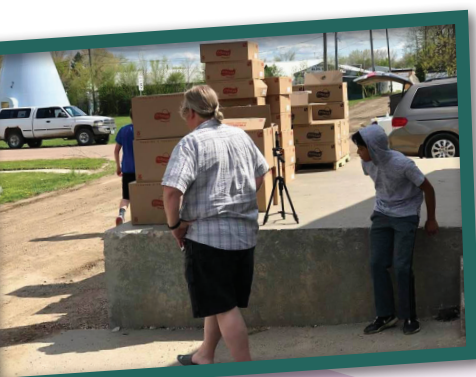
Food distribution at Blessings Repeated in Plankinton.