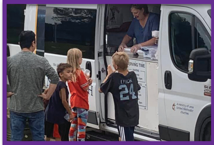
Members of Sunnycrest UMC serve a hot meal at Hayward elementary school.

Making masks: Families in the congregation have made and donated over 4,000 masks since the start of the COVID pandemic. Masks have been distributed to hospitals, businesses,